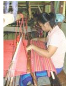
Young weaver in Thailand

Any one who has the experience of weaving knows that it is not a simple and instantaneous technique or procedure.