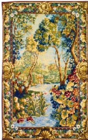
God weaves creation : one long work of "birthing"

To weave lasting links between persons presupposes a lot of patience - compassion - just like in weaving textile, the « knots » in the warf or the woof are proofs of reconciliation, links made over and over so that the textile gets longer.